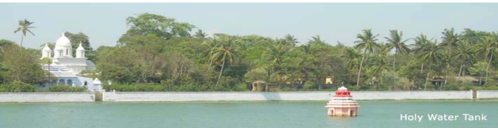
Holy Water Tank

Meet the weavers skilled in the famous 'Bandh' design. Learn the complexities of the tie and dye process. Amble their village and absorb how craft is woven seamlessly into daily life. Admire timeless techniques and visit the community weaver's co-operative society. Be enchanted by the majestic evening rituals of Dhavaleswar temple and spend the night on an island in the middle of Orissa's biggest most revered River Mahanadi.