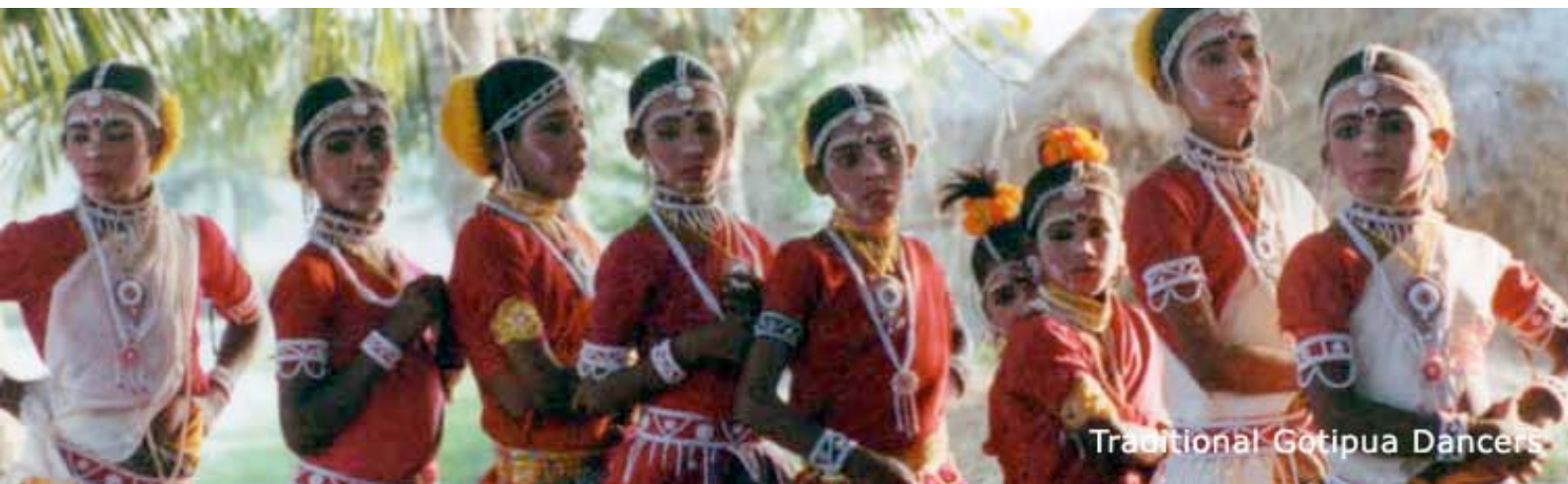
Traditional Gotipua Dancers