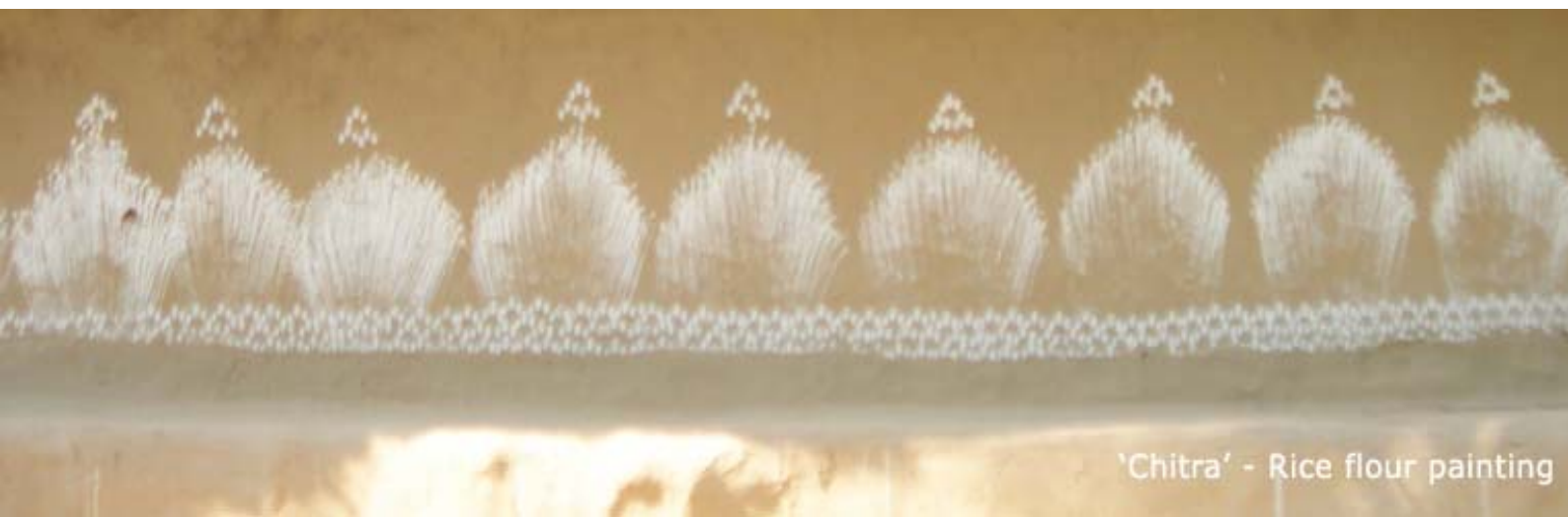
'Chitra' - Rice flour painting