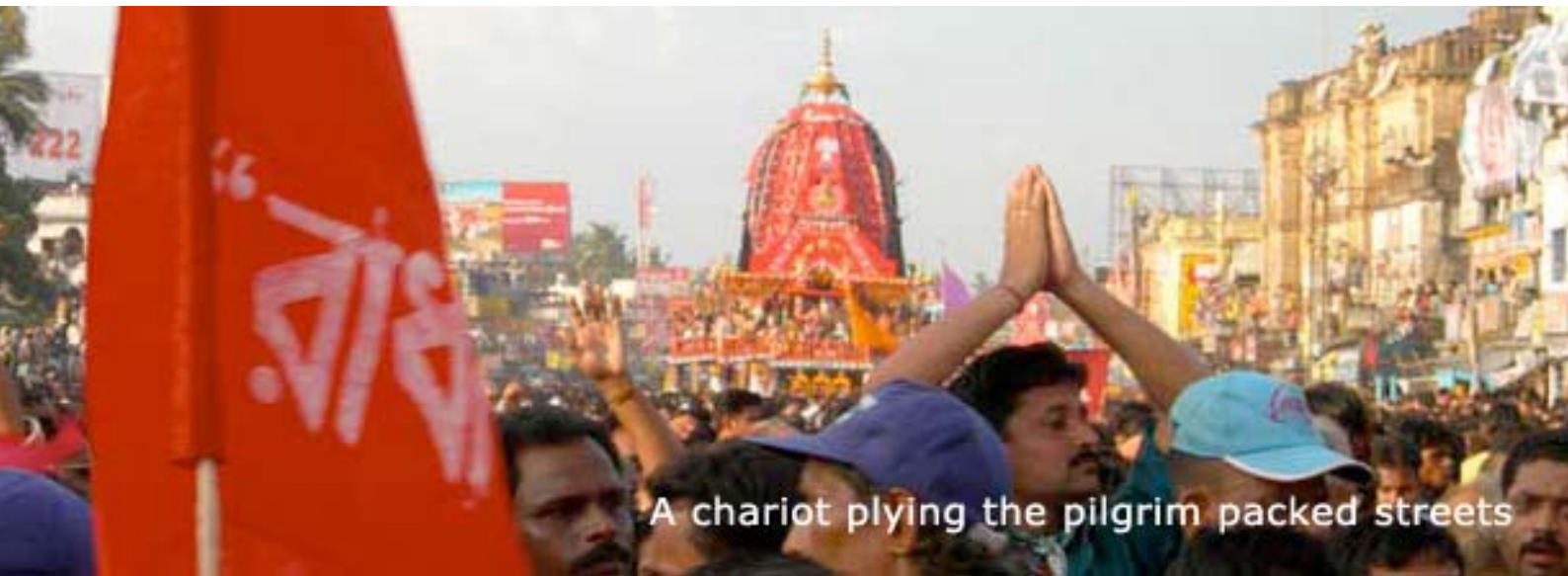
A chariot plying the pilgrim packed streets