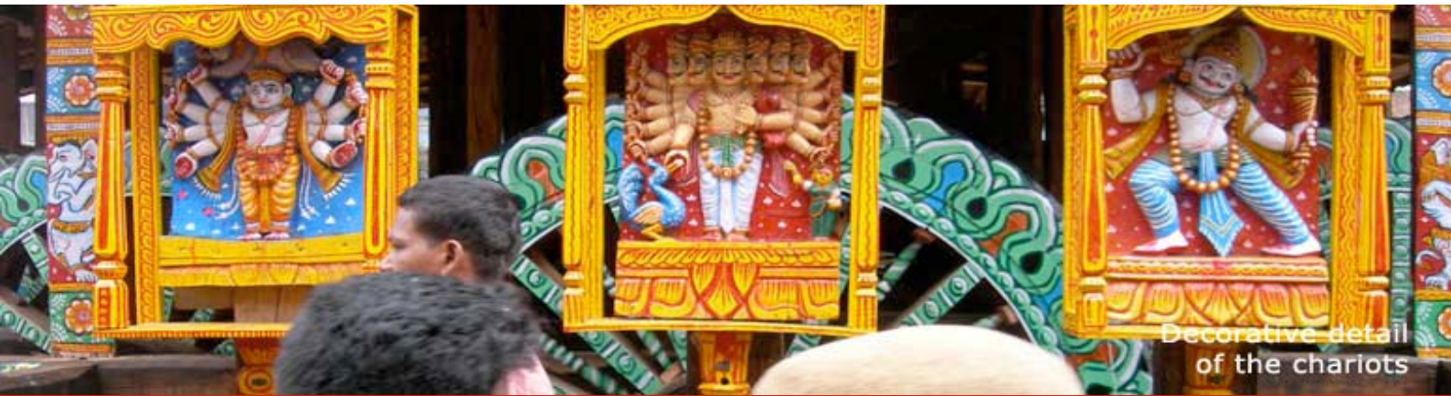
Decorative detail of the chariots

You are free to depart at any time of Day 8, or choose to stay on and spend a few extra days relaxing by the beach before heading home!