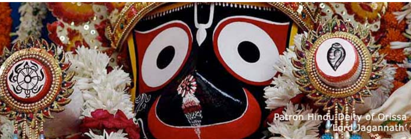
Patron Hindu Deity of Orissa 'Lord Jagannath'