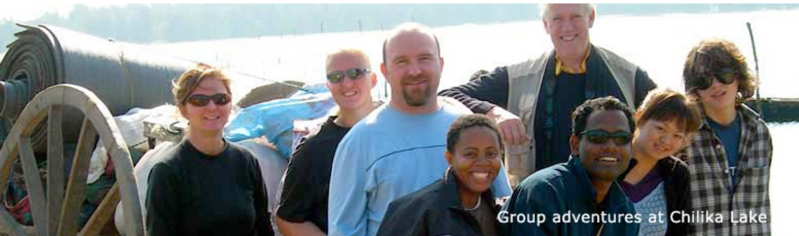
Group adventures at Chilika Lake