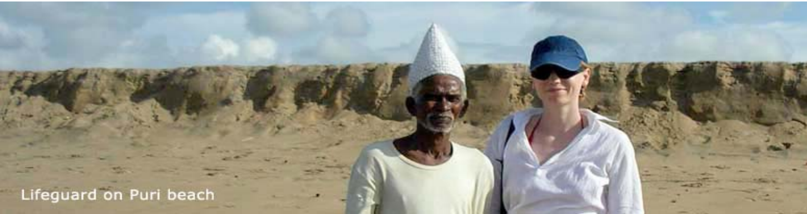
Lifeguard on Puri beach

Day 6 Depart Puri You are free to depart or stay on and enjoy the relaxed ambience. We can book Additional Accommodation and a Transfer by private air-conditioned vehicle to the airport for you, please let us know at the time of booking.