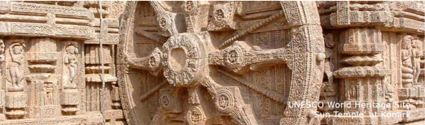
UNESCO World Heritage Site Sun Temple at Konark